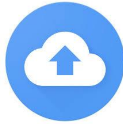
Backup & Sync